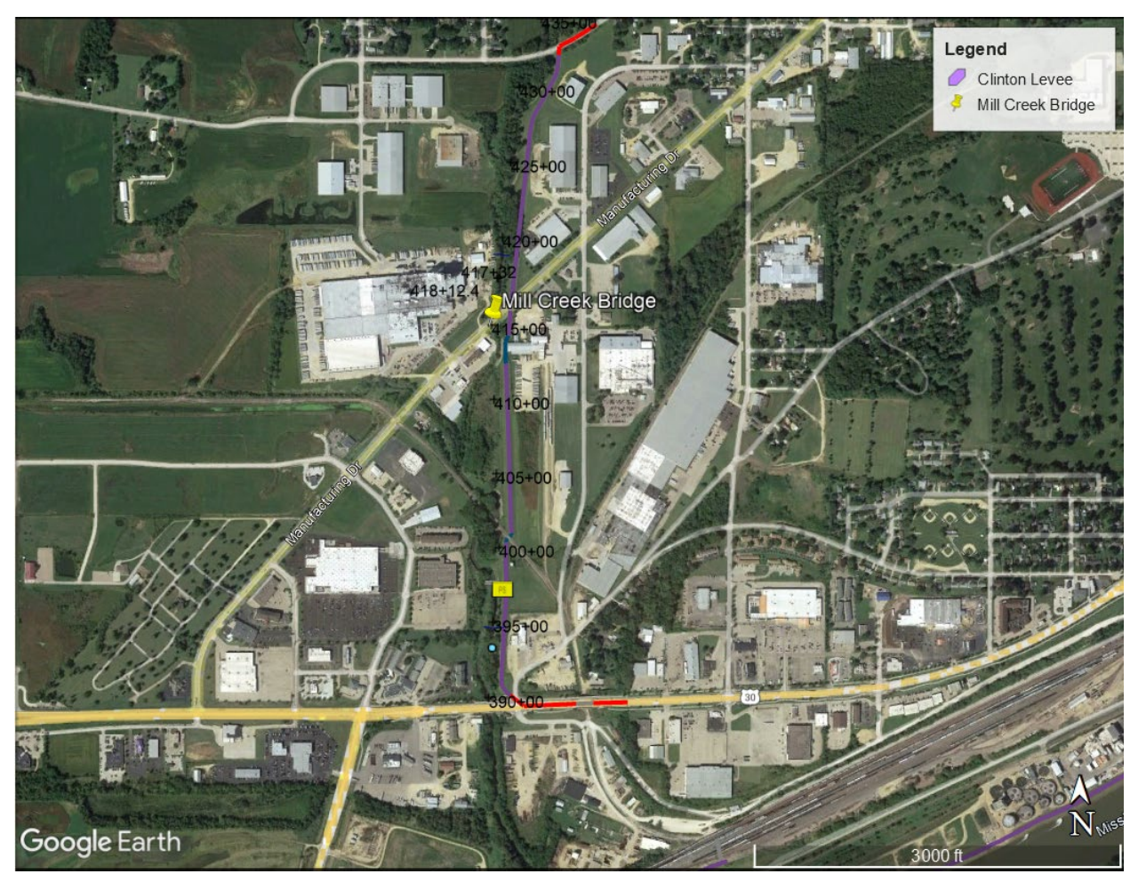
Figure 2. Project site map depicting the Mill Creek Bridge on Manufacturing Drive crossing the Clinton Local Flood Protection Project in Clinton, IA.